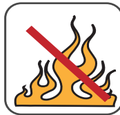
Flame Retardancy NF C32-070-2.1(C2) IEC60332-1-2/EN50265-2-1