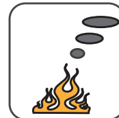
Low Smoke Emission IEC 61034-1&2 EN 50268-1&2/NF C32-07: