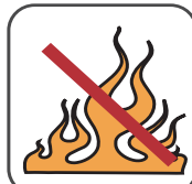
Fire Resistance IEC 60331 /NF C 32070-2.3(CR1)