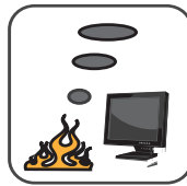
Low Corrosivity IEC60754-2 EN50267-2-2/3 NF C 32-074